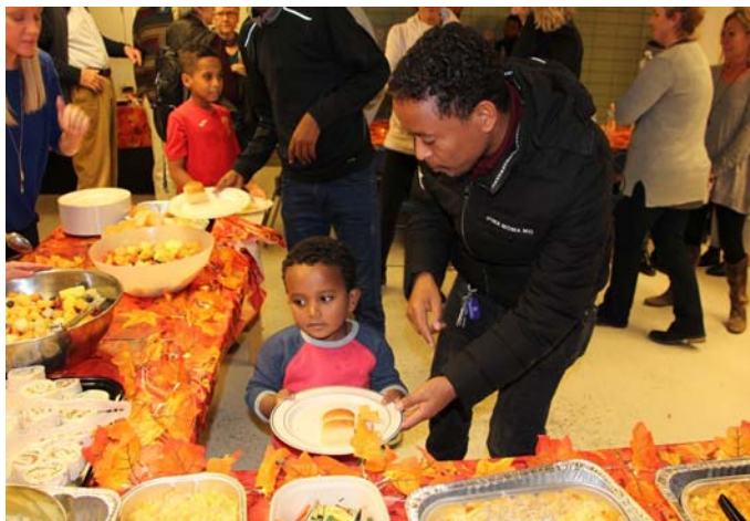
A picture from St. Thomas of Canterbury School Thanksgiving Harvest held on Saturday November 10th.